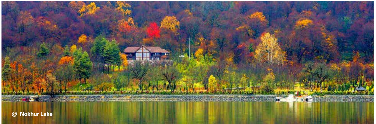
@ Nokhur Lake