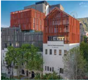
Tbilisi Saburtalo by Mercure Hotel