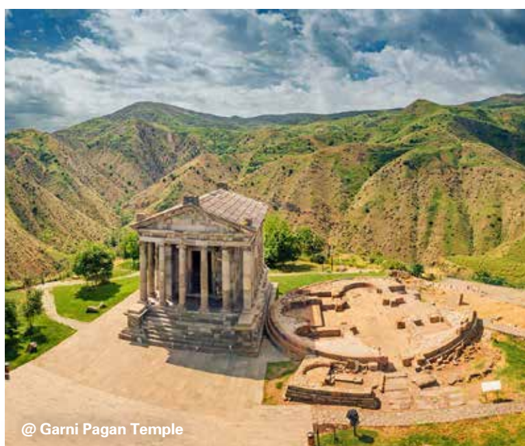
@ Garni Pagan Temple