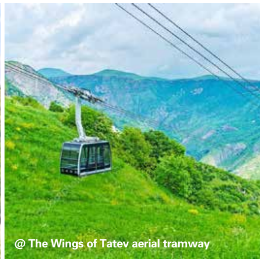
@ The Wings of Tatev aerial tramway