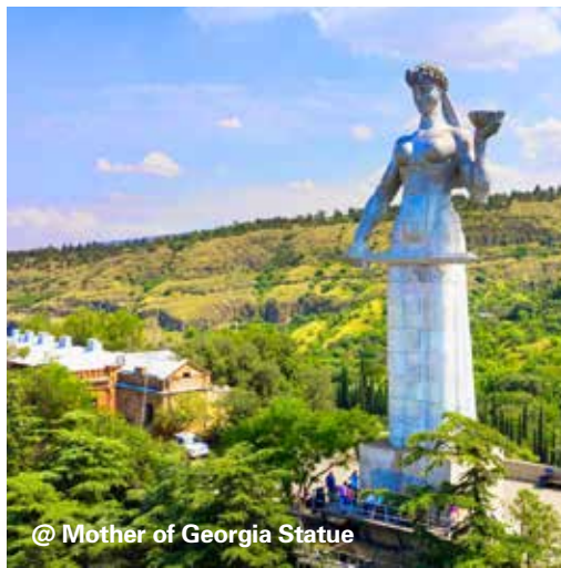
@ Mother of Georgia Statue