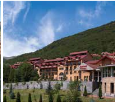
Tsaghkadzor Marriott Hotel