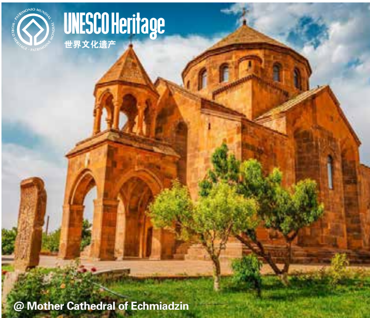
@ Mother Cathedral of Echmiadzin