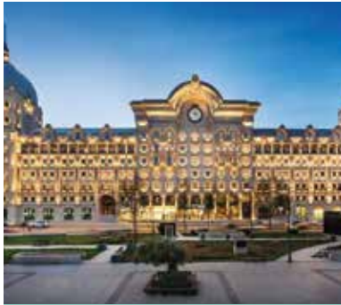
Courtyard Baku Hotel