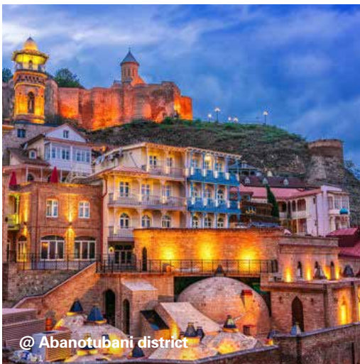
@ Abanotubani district